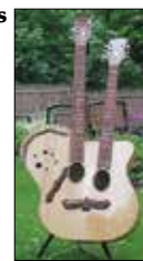
"The Dreamcaster" Custom built for Brian Henke

Refinishing Retruffing Intonation Adjustments Acoustic Pickup Installs